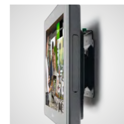
For table and wall mount (VESA)

Learn more from your Orderman partner or write to sales@orderman.com .