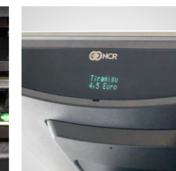
Elegantly integrated 2x20 character customer display (optional)