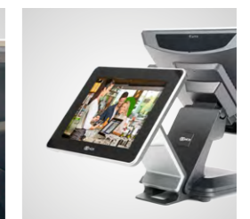
Customer displays in various designs (optional)