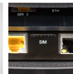
Direct connection of Orderman radio without power supply unit (PoE) (optional)